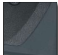
Rubber Sleeve The TTI-10 Handheld Thermometer is supplied with a protective rubber boot.