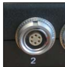
Input Connectors Highest quality latching metal 'Lemo' connectors.